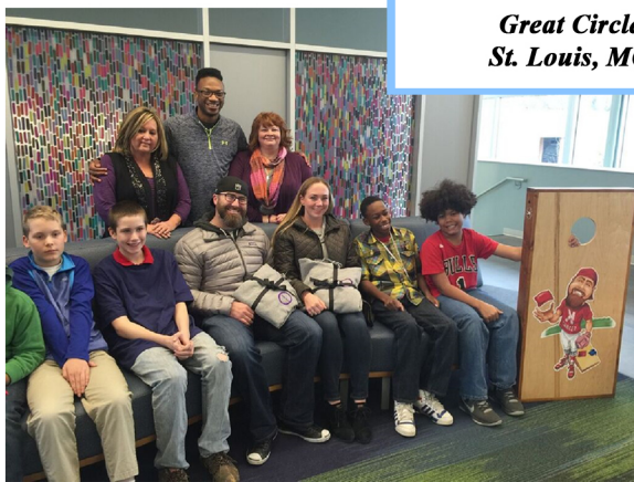
Great Circle St. Louis, MO