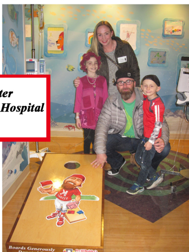
Bob Costas Cancer Center Cardinal Glennon Children's Hospital St. Louis, MO