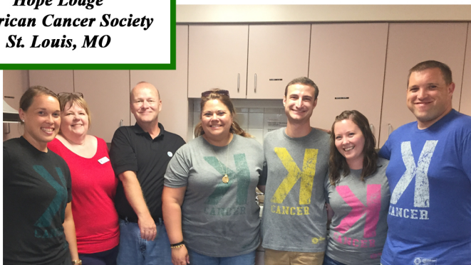
Hope Lodge American Cancer Society St. Louis, MO