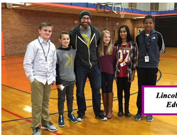
Lincoln Middle School Edwardsville, IL